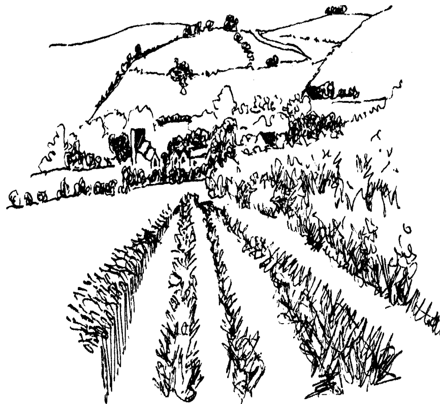
Brixton Deverill from the east by Pat Armstrong